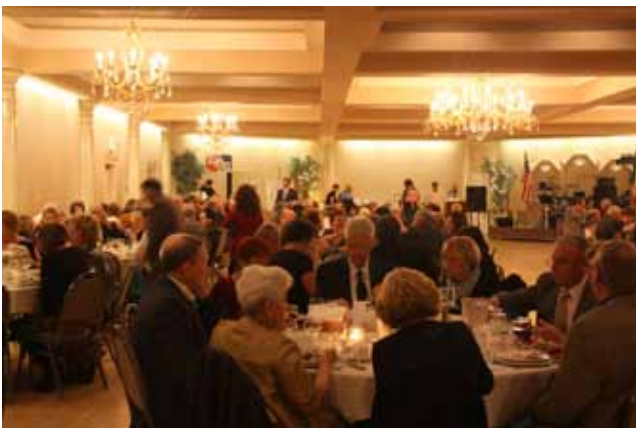
Peninsula Italian American Social Club dinner

Finally, I'd like to welcome the new volunteer graduates, who join more than 90 individuals visiting patients and their families, providing invaluable comfort and support. Their presence makes a significant difference in the lives of those we serve. 🐾